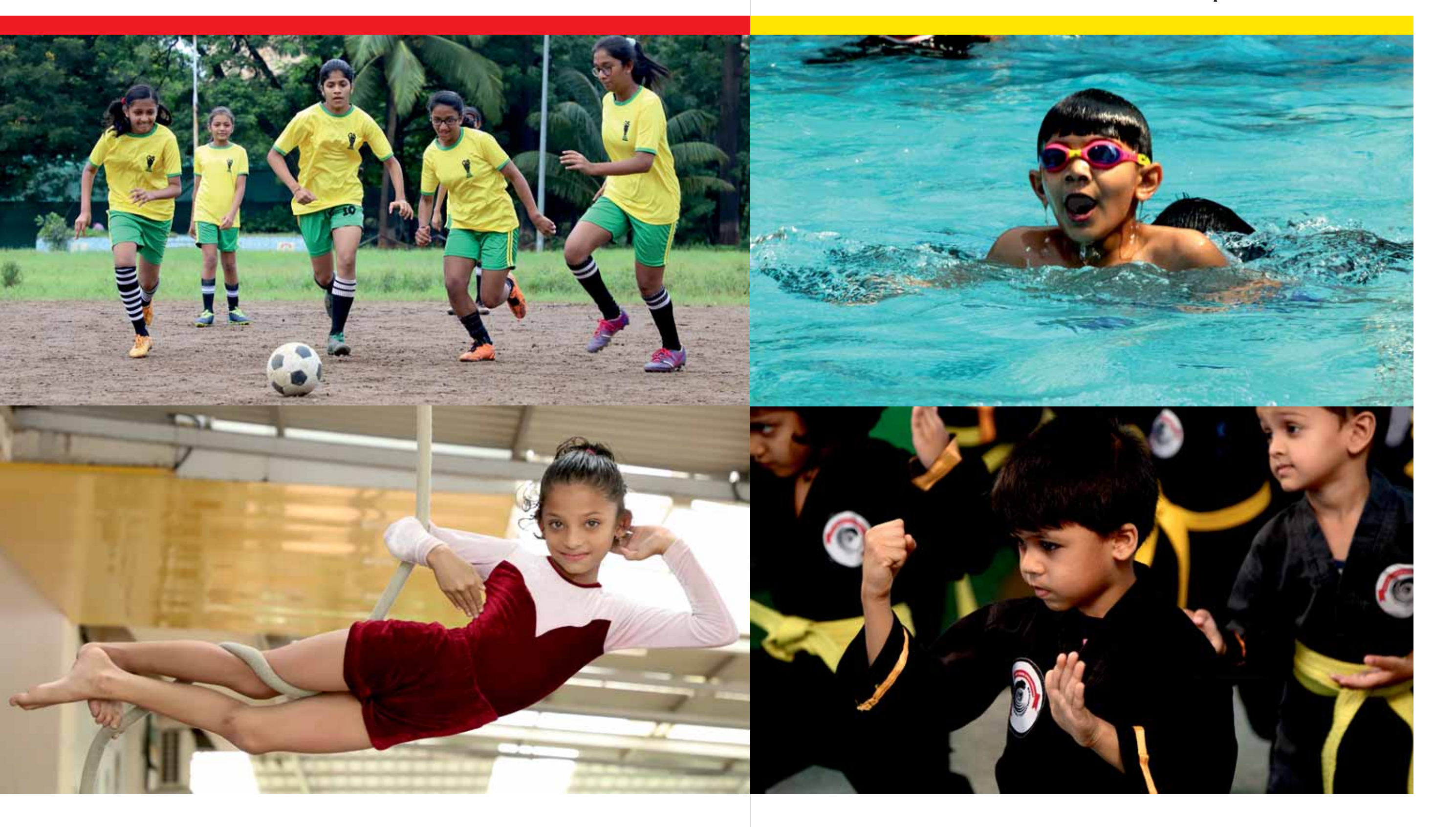
Sports and Games